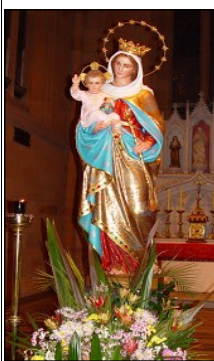
Our Lady Help of Christians St Mary's Cathedral Sydney

In the following points, I would like to highlight thirty-one ways, one for each day of May, by which we might come to know and love our Mother in a deeper manner. When we give ourselves to her and allow her to teach and guide us, we can more effectively be her hands and feet in bringing others to Jesus. We will be better able to make Jesus known to the world at large because that is what Our Lady does.